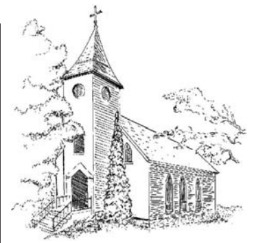
St. Mary of the Rosary, Hepworth Sunday 9:00 am (Nov-Mar)

Email: smm@bmts.com www.stmarysandthemissions.ca