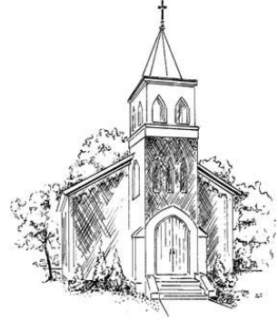
St. Stanislaus, Chatsworth Sunday 9:00 am